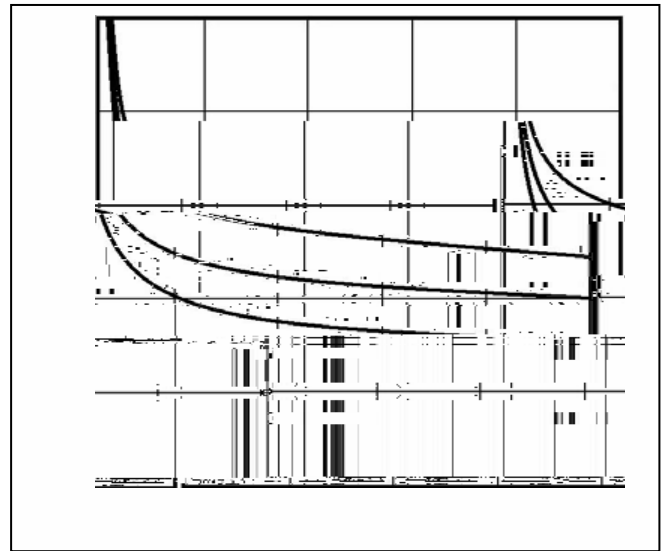
Fig4. Reverse Recovery Charge vs di_F/dt