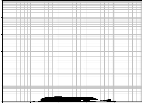
Figure 13. Maximum Transient Thermal Impedance